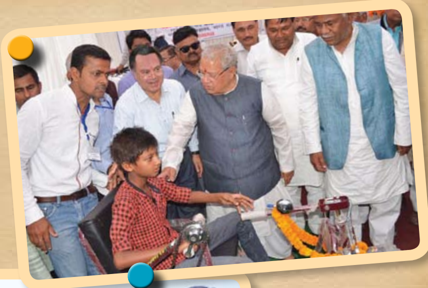
Distribution of aids & equipments by Sh. Kalraj Mishra, Hon'ble Minister for MSME to differently abled persons in Deoria under CSR initiatives of NSIC.