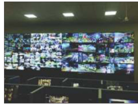
A glimpse of CCTV system installed at Still Tirumala Tirupati Devasthanam