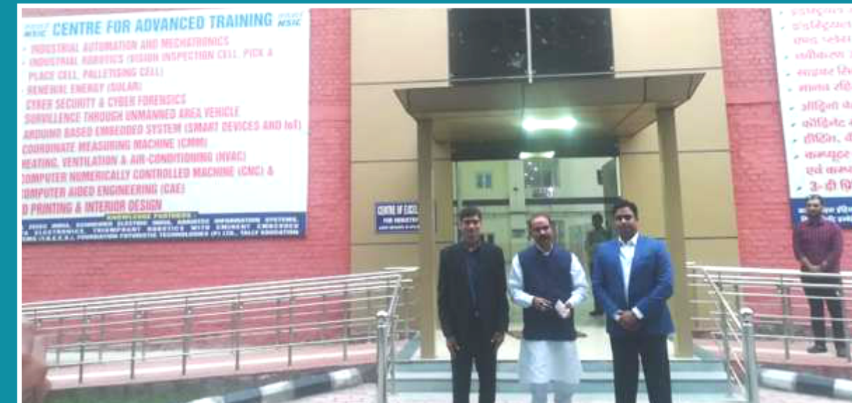
Hon'ble Minister of State for Textiles appreciates efforts of NSIC in creating entrepreneurship culture in the country.

Hon'ble Minister of State for Textiles, Sh. Ajay Tamta visited NTSC Okhla on 08.11.2018 and appreciated the efforts of NSIC in creating entrepreneurship culture in the country. Hon'be Minister interacted with ongoing trainees and appreciated the various training modules which are being conducting in NTSC Okhla.